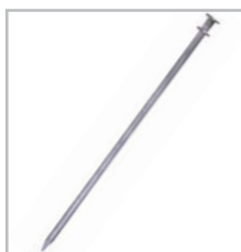
LPP0006 GROUND ANCHOR STAKE